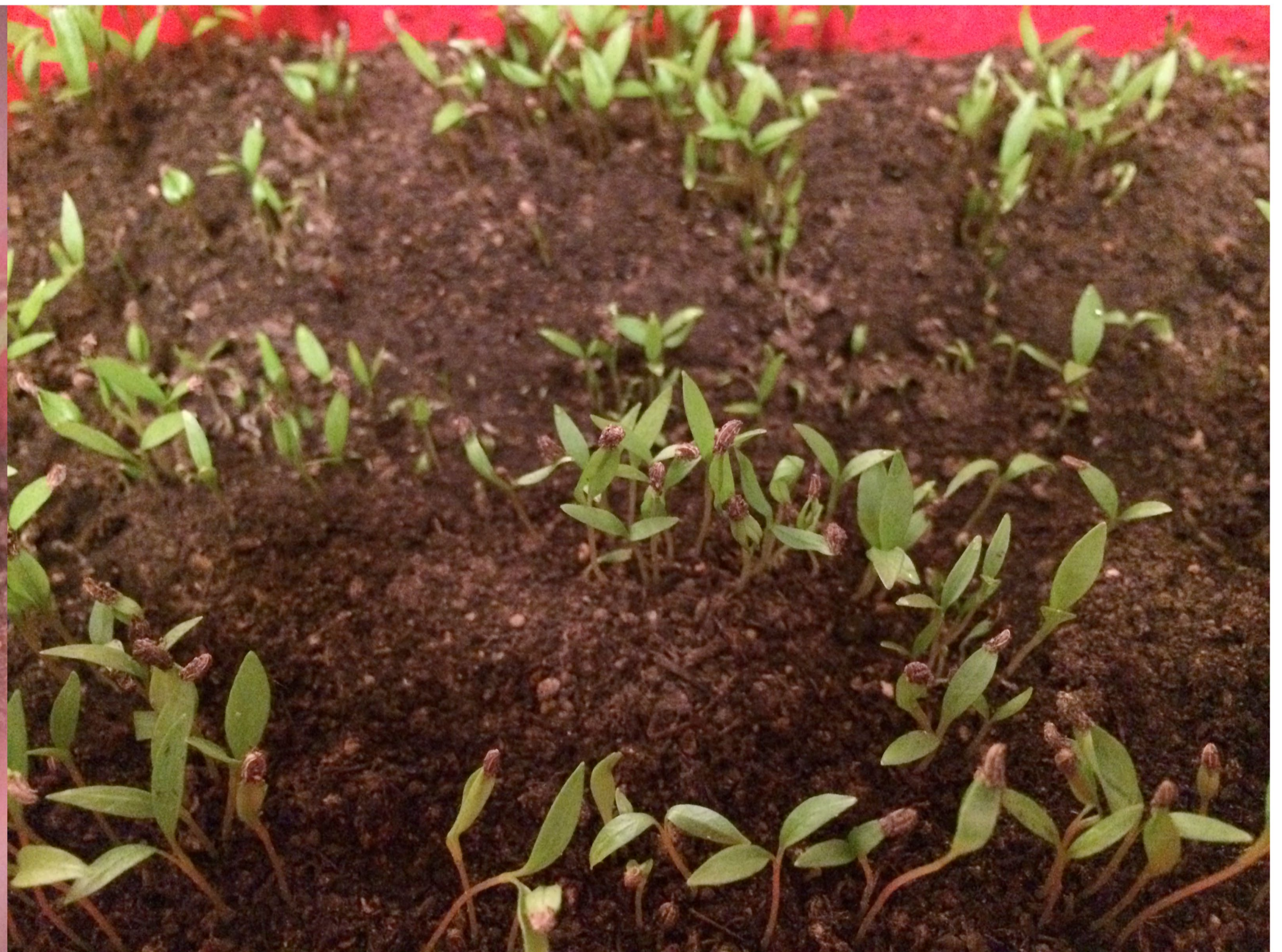
Model 1 - Agriculture Principle